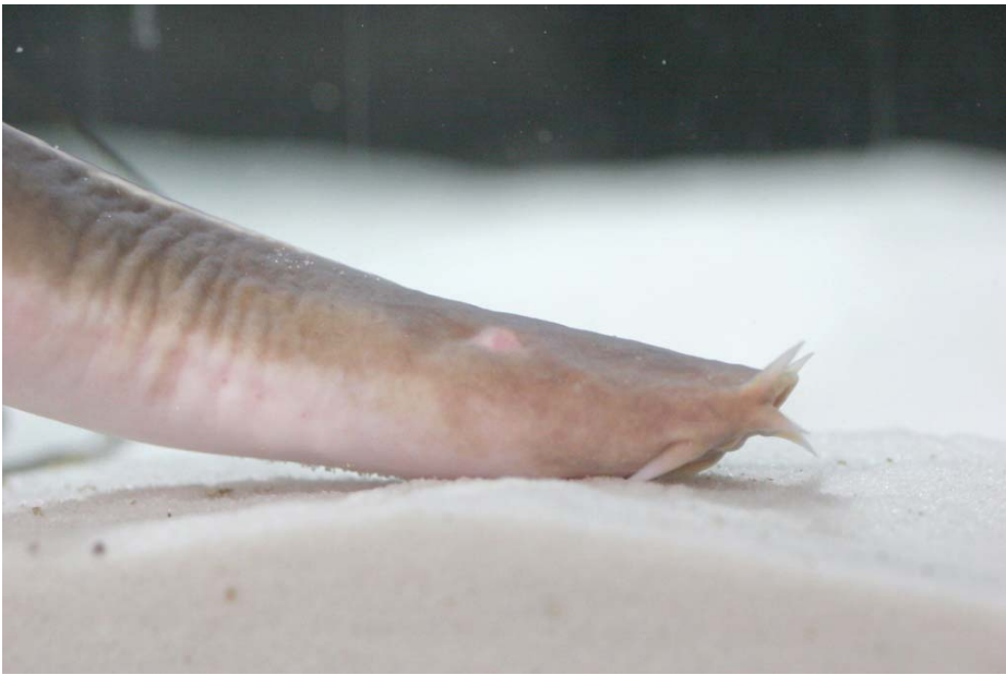
Hagfish maintained in laboratory aquarium

March 19, 2007 – The possession of a hinged jaw is a trait shared by many, but not all vertebrates. The cyclostomes, such as lampreys and hagfish, are vertebrate taxa but feed by means of circular mouthparts, which can be used for either predation or scavenging. Even within the Cyclostomata, considerable diversity can be found; indeed the hagfish, in which many primitive traits are preserved, are sometimes considered to be markedly distinct to both the jawed vertebrates (gnathostomes) and the lampreys. It has long been suspected that an analysis of hagfish embryonic development would shed light into the question of its true phylogenetic position, which conceivably is near to the branch point of the vertebrate divergence, but their seafloor habitat is little explored and hagfish eggs have proven extremely difficult to obtain. So difficult, in fact, that the last major research into hagfish development dates back to an 1899 treatise by Bashford Dean.