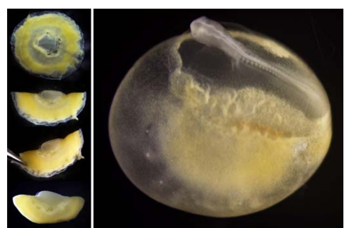
The MC culture is prepared by folding the streak stage embryo and trimming the margins (left). After one day in culture, the embryo inflates into a balloon shape, with the embryo proper positioned on top and growing healthily.

January 4, 2010 – Birds, such as the chicken, provide an excellent model for the study of many developmental processes, and remain one of the most commonly studied species in classical embryology. The earliest stages of avian embryonic development are not amenable, however, to manipulation within the egg, necessitating methods for embryo culture. A number of techniques for sustaining the growth of chicken embryos ex ovo have been developed, but are limited by cumbersome set-up and relatively short survival times. Methodological advances might therefore expand the utility of ex ovo approaches and enable studies of later occurring developmental phenomena.